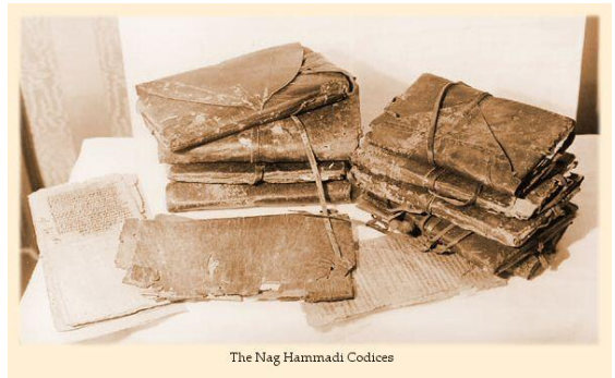
The Nag Hammadi Codices

The Gospel of Thomas was discovered in 1945 at Nag Hammadi, Egypt. It was part of a collection of manuscripts called the Nag Hammadi Codices, which were written in Coptic between 350-400 A.D.